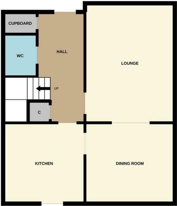
GROUND FLOOR 59.0 sq.m. approx.